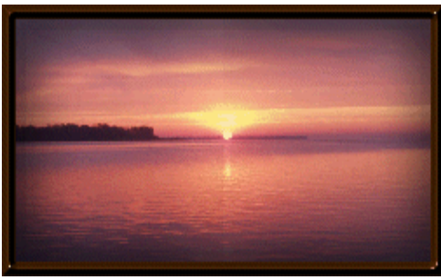
Detroit River Sunrise